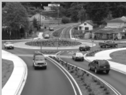
New roundabout near Lake Stevens