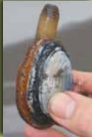
Softshell clam from South Skagit Bay

The challenge now is to protect these water quality improvements for shellfish harvest and continue to clean up the streams and river reaches that are impaired for recreational use.