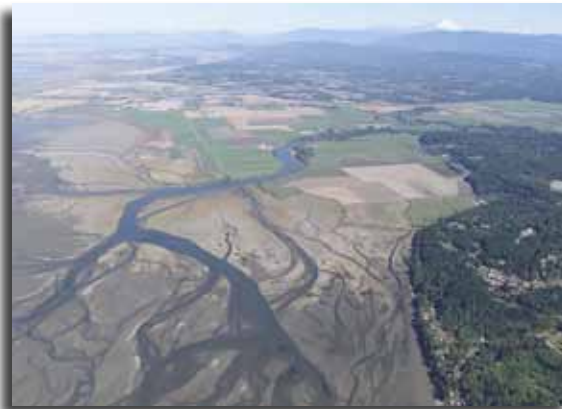
Stillaguamish River flowing into Port Susan