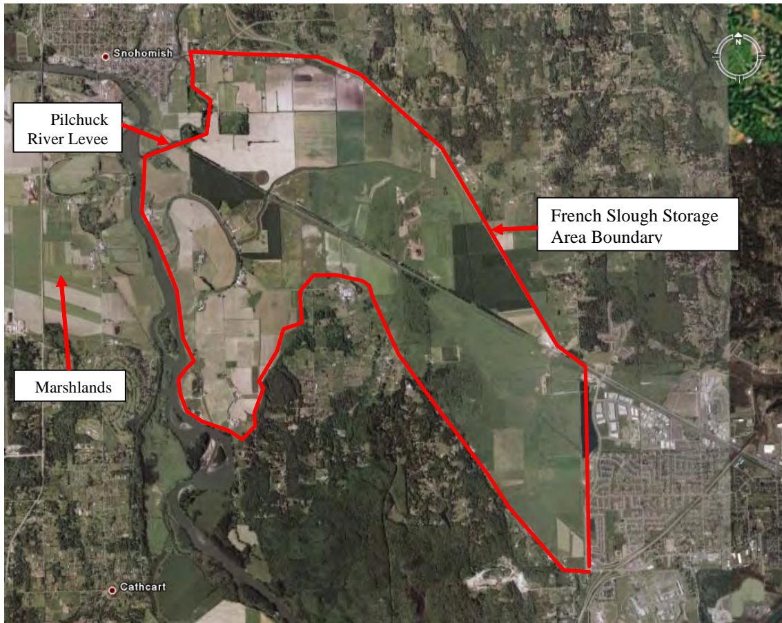
Figure 2. French Slough Area Showing Pilchuck Levee