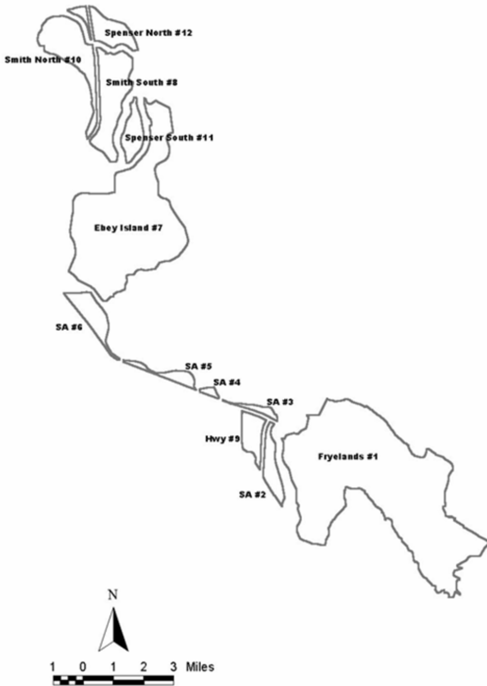
Figure 1. Storage Areas Used in Hydraulic Model