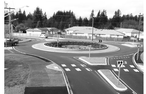
Roundabout in Marysville