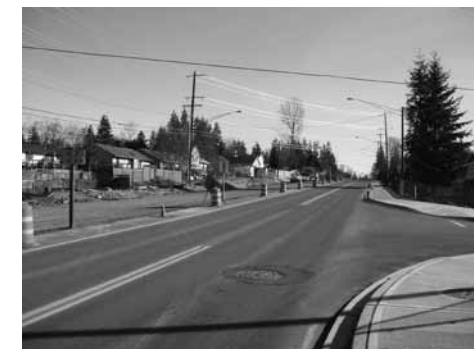
Phase I of 20th Street SE looking east. The south half of the road between S. Lake Stevens Road and 91st Avenue SE is shown on the right in the photo above. The road was widened and sidewalks are finished. Construction has moved to the north half of 20th Street SE shown on the left.

The stormwater drainage system has been installed on the north side and sewer line connections have been extended to the line on the south side of 20th. Many of the rockeries are finished and the roadway is being excavated section by section to the correct height for paving this summer. As soon as the wall at 94th Street SE