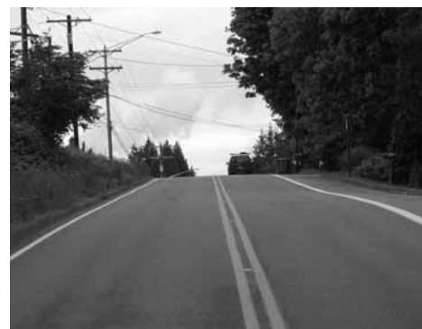
Looking east on 20th Street SE toward 110th Drive SE

During construction a single lane closure will be in effect. Alternating east and west bound traffic will be controlled by a temporary traffic signal that will be in operation until the project is completed. Construction will last for up to 12 weeks. After the crest is lowered, 20th Street SE will be restored to its current configuration with no changes to the roadway width or alignment. Included in the completion of the project will be the re-grading of affected driveways.