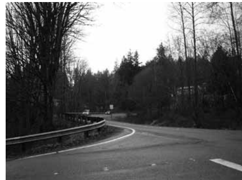
Looking west toward Machias Cut-off from Williams Road