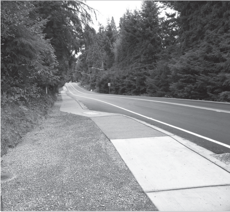
The new 57th Ave. SE sidewalk from the elementary school north to 228th St. SE was completed in September.