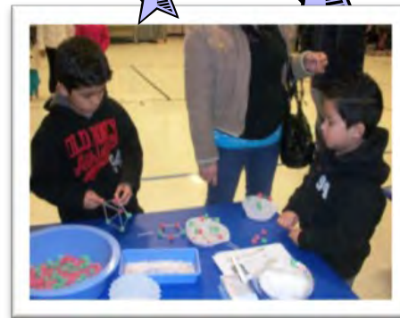
Building domes with toothpicks and gumdrops!