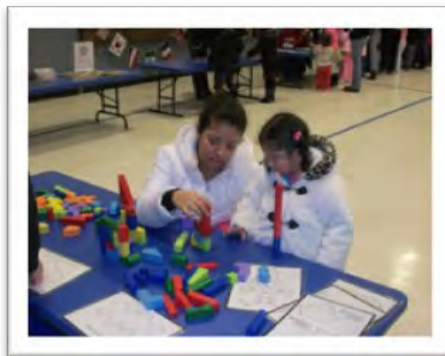
Building with tangrams!