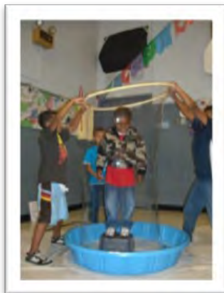
Standing inside a bubble was a huge hit!