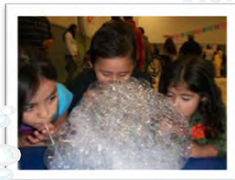
Blowing lots of bubbles!

At Mukilteo ECEAP, we held the Bubble Festival and Adventures in Number Land family nights in November and December. For both events, we had a total of 298 adults and children; all had a great time playing and learning! Each night we had 10 different stations for the families to visit and actively participate.