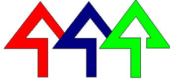
Table of Contents SNOHOMISH COUNTY MONTHLY FINANCIAL REPORT