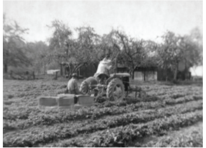
Molenaar Farm (1930s)