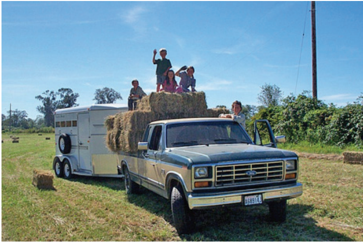
Loading the hay harvest