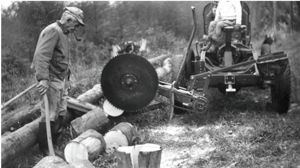
Molenaar Farm (1930s)